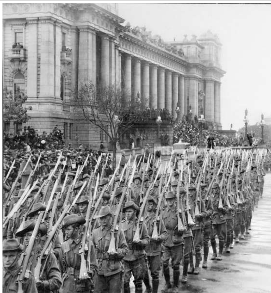
12,918. "AT THE EMPIRE'S CALL." The Sturdy Members of the Australian Expeditionary Force Marching through Melbourne.